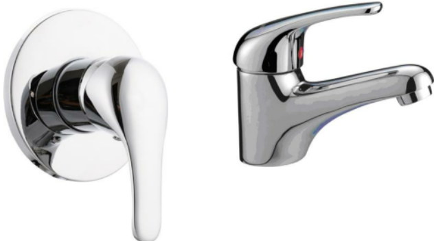
Single lever chrome mixers