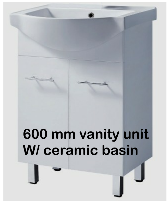
600 mm vanity unit W/ ceramic basin