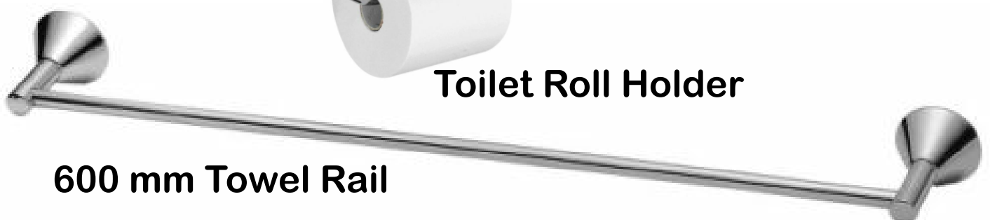
600 mm Towel Rail