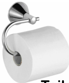
Toilet Roll Holder